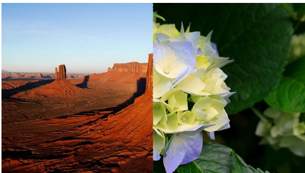
Left To Right 01