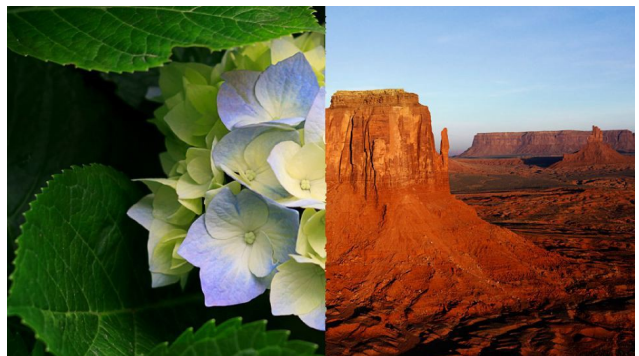
Left To Right 02